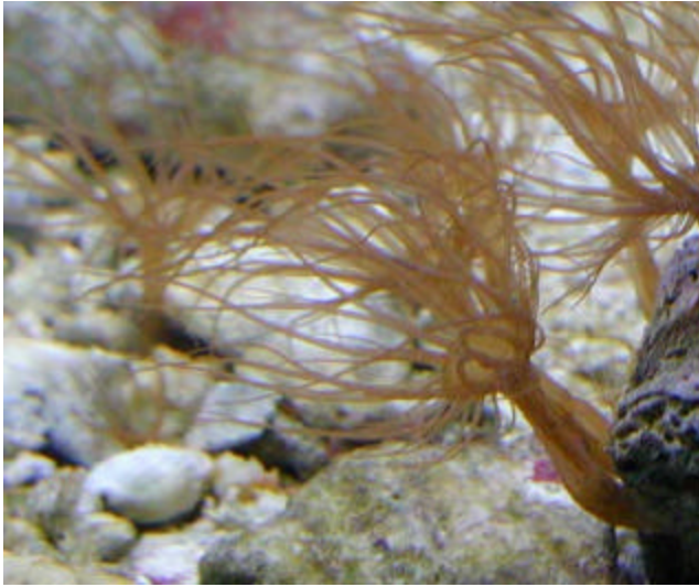
THE PEST ANEMONE – AIPTASIA

The loathed Aiptasia Anemone seems to show up in any aquarium that contains live rock. These anemones not only multiply at an unbelievable rate, they also have a powerful sting that can harm fish and live corals. There are two methods for ridding your aquarium of these pest anemones: